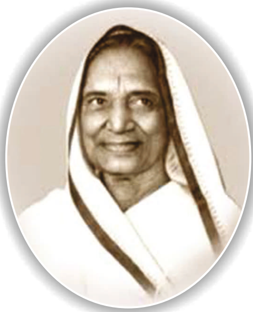
Smt. Jankidevi Bajaj

Smt. Jankidevi Bajaj, a shining inspiration to Bajaj family, the society and the country was born on 7th January 1893. The foremost personality among those who deeply influenced Jankidevi, was her husband Shri Jamnalal Bajaj who was not only a rich businessman but also a religious devotee, a follower of Mahatma Gandhi, a social reformer, and a staunch Nationalist.